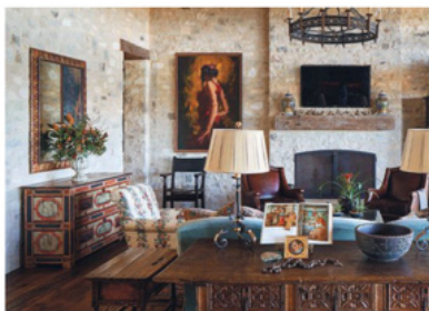
80 INTERIORS WINTER/SPRING 2017